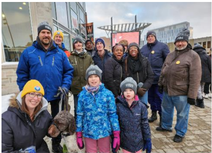
The Christ Church 2023 Team