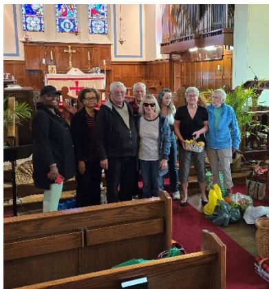
2024 Harvest Outreach & Decorating

A lso on Sunday, October 5 ~ the Altar Guild is having a bake sale and you won't want to miss it.