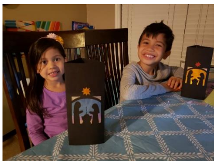
Advent Event Crafts.

Our Youth Group continues to meet semi-monthly on Friday evenings. Our core group of 10 has been so faithful throughout the pandemic ~ we thought they would be "zoomed-out" by now! We managed to get in one in-person event prior to Omicron wave hitting us in December and most definitely look forward to more in-person events in the months to come.