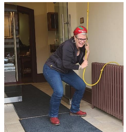
Laughter among friends and family