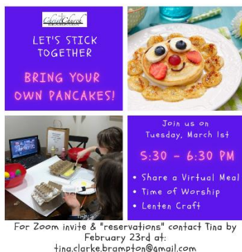
2 nd Annual Virtual Shrove Tuesday