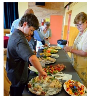
Reception (June 2017)