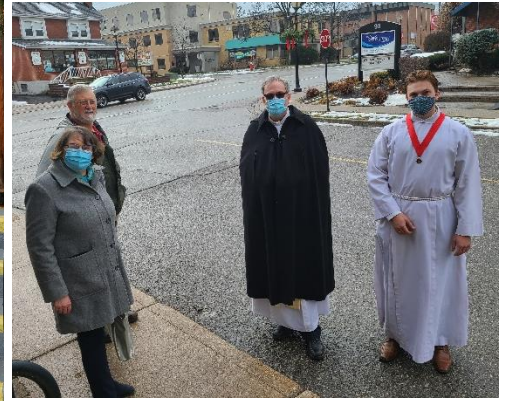
Christmas Morning 2021