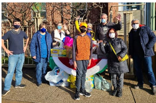
Drive-By/Drop-Off (December 2021)

For more photos of our Christmas Caring & Sharing: