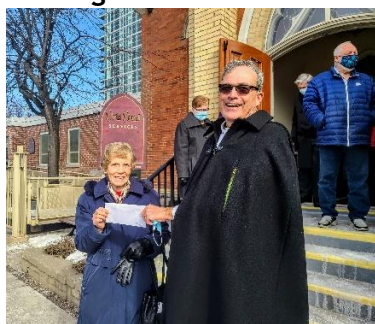
Cheque Presentation (January 2022)