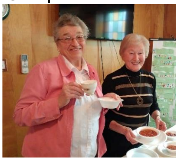
Chili Lunch (April 2018)