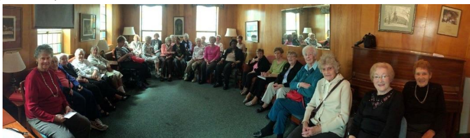
Parish Fellowship Group (Feb 2018)