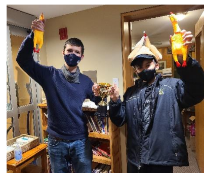
Youth Group Rubber Chicken Winners