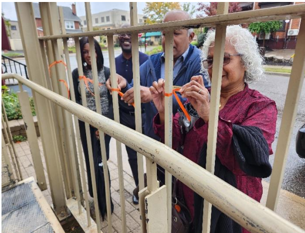
National Day of Truth & Reconciliation (September 2022)