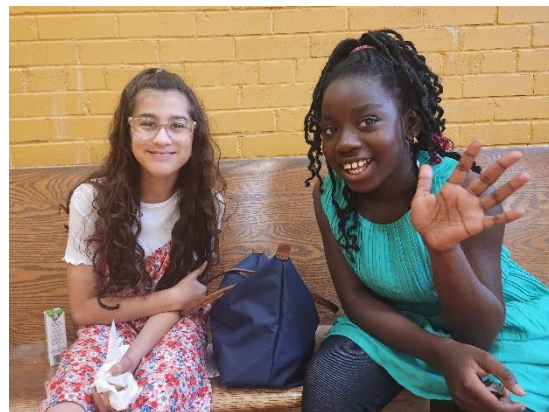
Making Friends (November 2022)