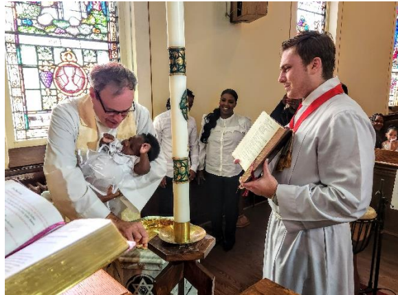
All Saints (October 2022)