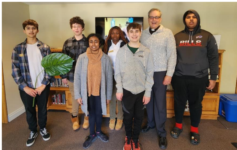
Confirmation Classes (Launched Ash Wednesday)