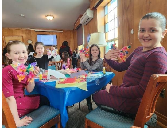
Easter Crafts (April 2023)