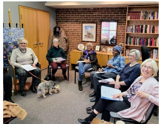
Making Plans for Holy Week 2023