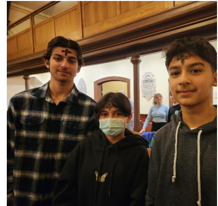
A Snowy Ash Wednesday Evening