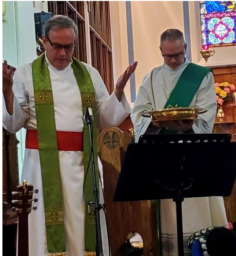
Blessing of Backpacks (September 2022)