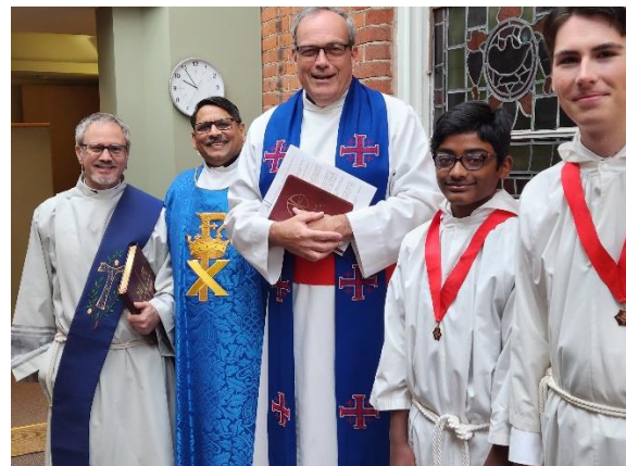
1 st Sunday in Advent

Follow Christ Church, Brampton on Facebook and Instagram ~ that's where the photos are! Liking, commenting and sharing our posts is an easy way to share with others about Christ Church. And probably one of the easiest ways to invite family, friends and neighbours. Check out our website for all current information: www.christchurchbrampton.ca