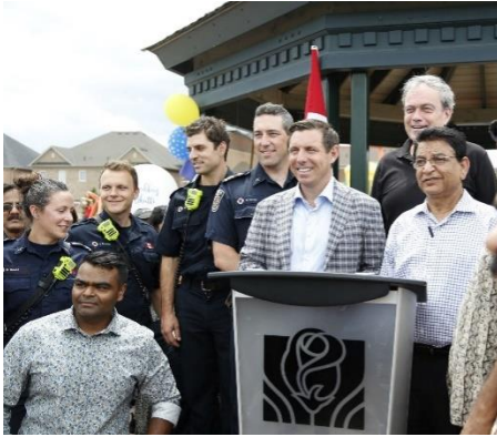
Shahbaz Bhatti Park Dedication (July 2022)