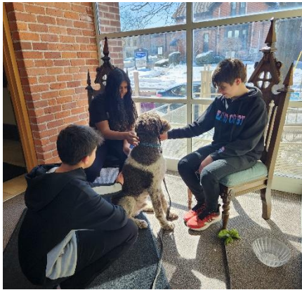
Taking a Break (Winter 2023)