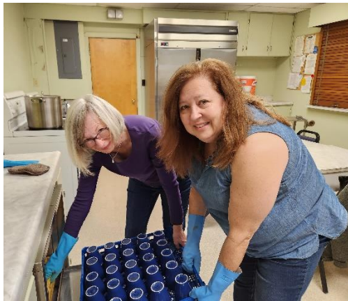
Prepping the Kitchen (November 2022)