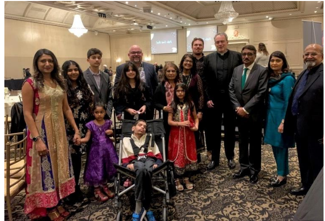
ICV Gala (March 2023)