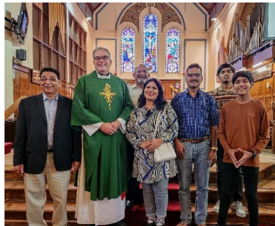
Gill Family worshipping at Christ Church (July 2023)