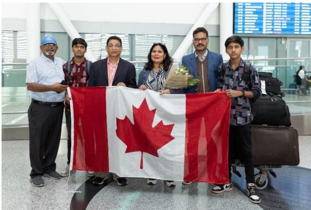
Gill Family arriving in Toronto as refugees (June 2023)