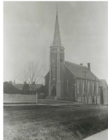
Christ Church 1885

Christ Church Anglican 4 Elizabeth Street North Brampton, Ontario L6X 1S2 905-451-6649