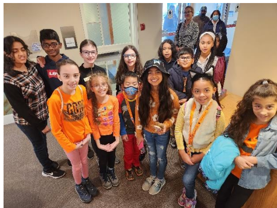
Getting Ready for Pumpkin Party (October 2022)