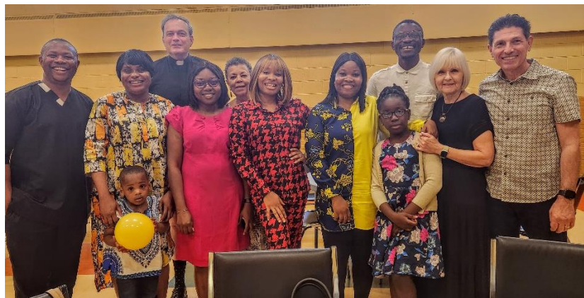
Non-DNA Family (June 2023)