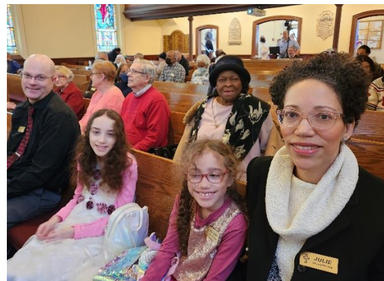
Gathering for Worship