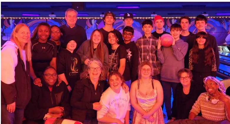
Bowling (February 2023)