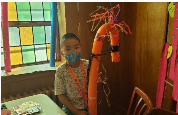
Knights of the North Castle (Summer/Fall 2022)