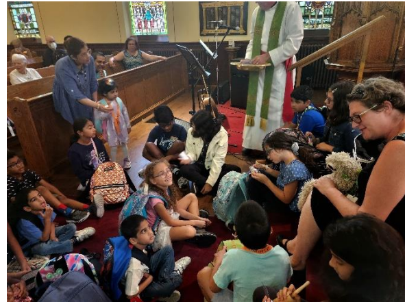
Blessing of the Back Packs (September 2022)