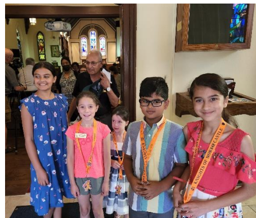
Greeters (Summer 2022)