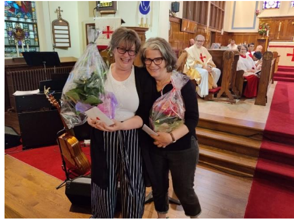
A Surprise Thank You (May 2023)