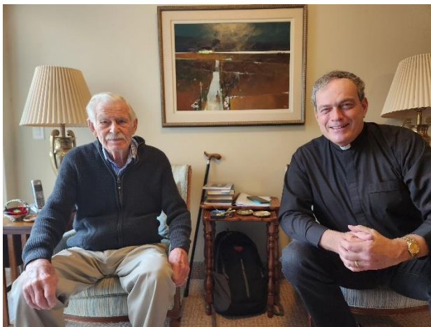
Home Communion (Easter 2023)