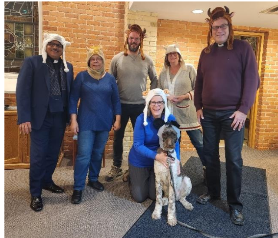
Prepping for Christmas Pageant (December 2022)