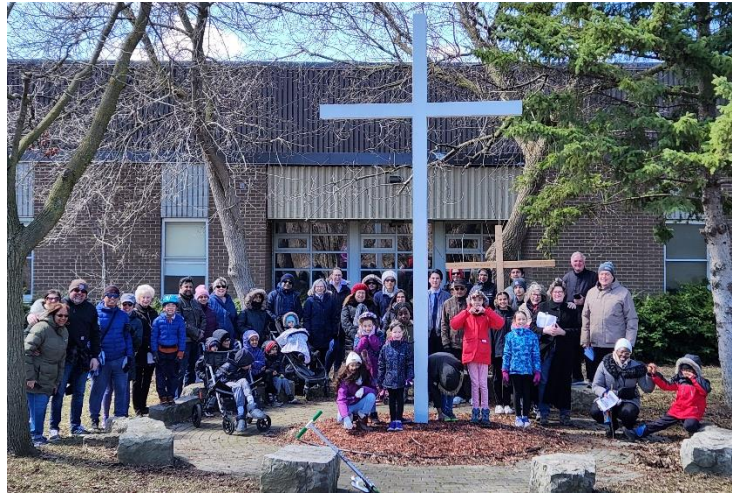
Good Friday Prayer Walk