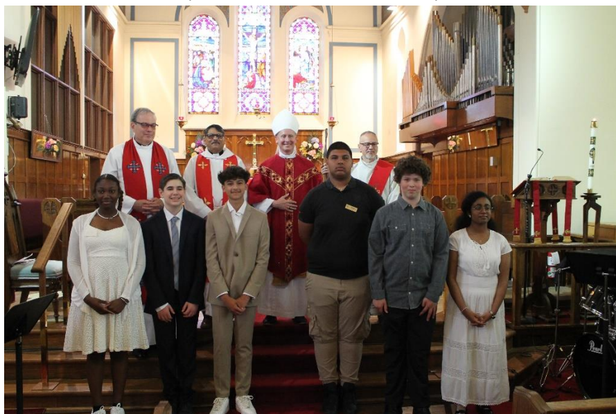
Celebration of Confirmation on the Feast of Pentecost | May 28, 2023