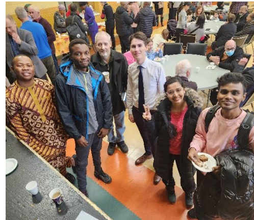
Welcoming Newcomers (February 2023)