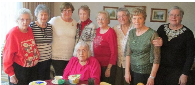
Our Parish Fellowship Group at their Christmas luncheon

There were Children & Youth everywhere from reading the lessons at Lessons & Carols to angels waiting in the wings.