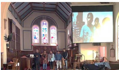
Christian Voice International presented a workshop on persecuted Pakistanis.