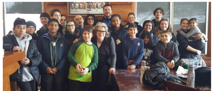
Our intrepid snow tubers in early January