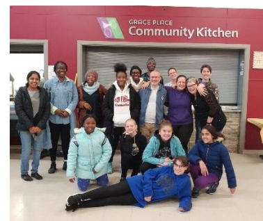
Christ Church Youth at serving breakfast before church in October.

You can simply make a direct donation by following the link below or use offering envelopes located in the Parish Office. The latter will be receipted by Christ Church but the funds will be directed to Coldest Night of the Year.