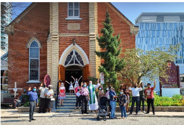
The warm and dry Sunday mornings have been a blessing to those attending in-person worship.

Weekly Announcements/Service Bulletins are available each week on our website to keep you well informed on the “happenings” at Christ Church and beyond. Again these are available on our website.