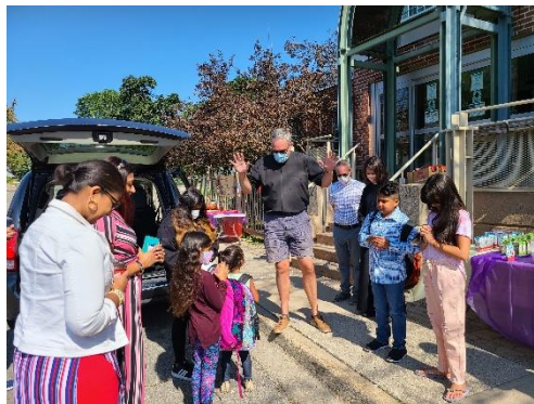
Our Drive-By Blessing of the Back Packs was on September 4.