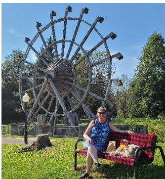
This fall, our Church Online Children's Focus is on Moe & Bo's Big European Vacation.