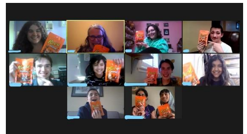
Our Youth Group meets semi-monthly via Zoom. Over the year we have celebrated many birthdays.