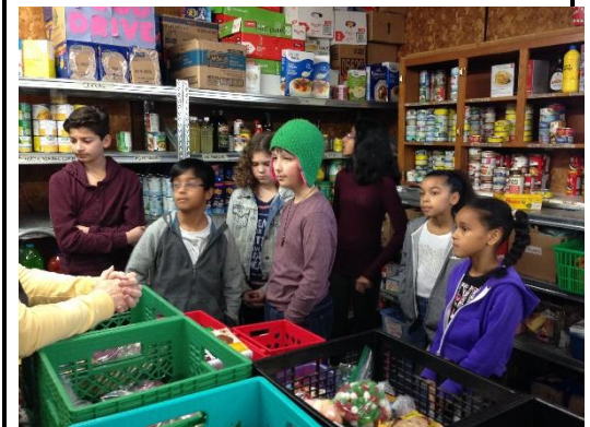
And a little later in the morning for our Junior Youth