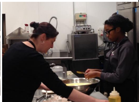
An early Saturday morning start for our Senior Youth! Our Senior Youth will also be volunteering at the Regeneration Easter Dinner.