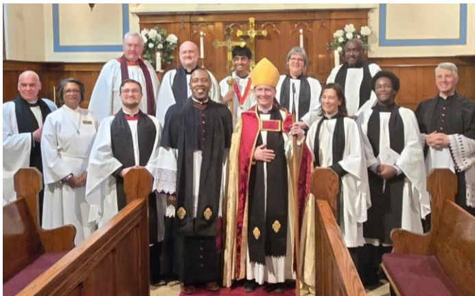
Celebration of New Ministry | Jan 18/26

Phone: 416-660-0557 | Email: charter.liz@outlook.com