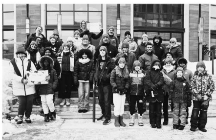
"Our Walking Family" | 2025 Team

Join "Our Walking Family" Saturday, February 28