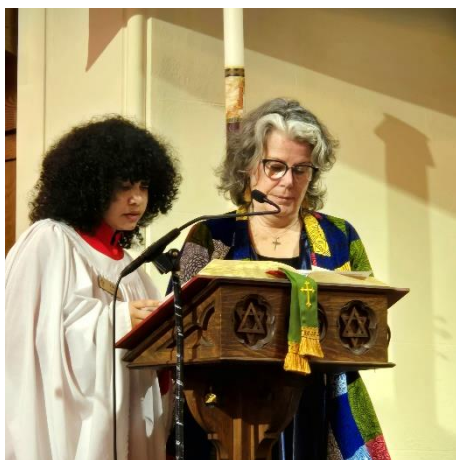
Celebrating | Our 2025 Confirmants are participating in Sunday worship.