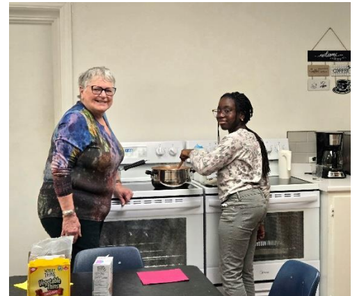
Serving | Saturday Sacred Sewing (and eating) continues to thrive, just yesterday we participated in CNOY in support of Regeneration Outreach Community.

It is difficult to select photos that tell the story of the life we share at Christ Church but do keep an eye out on our social media platforms where there are plenty! We look forward to a new photo album on our website covering the Season of Epiphany. In the meantime, take a peek at Advent & Christmas at: