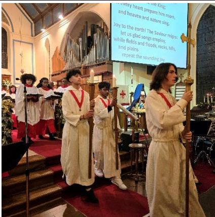
Celebrating | Christmas Eve attendance increased by 42%.

We believe that communication is one of our primary responsibilities. It is one of the tools that keeps our community at Christ Church connected. As the leaders of Christ Church, it is our privilege and responsibility to share how Christ Church is doing financially and to invite the entire Parish to participate in our ministry with their time, talents and treasures. It has been our practice for several years to provide financial updates. We appreciate that not everyone is interested in the finances of the church but like all communications it is an important part of our responsibility and a responsibility that we all share. Kindly take time to read this important update.