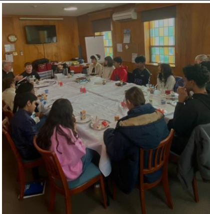
Proclaiming | A total of 19 are being prepared for Confirmation.