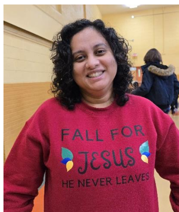
Proclaiming | Fall for Jesus He Never Leaves. 😊