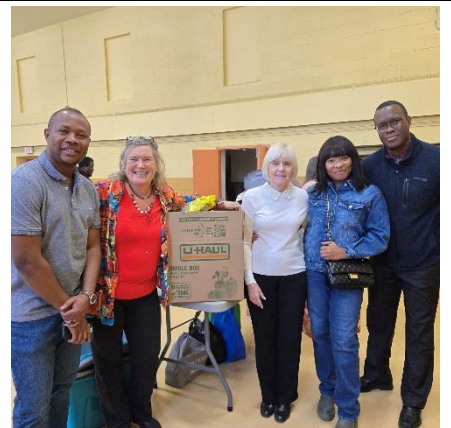
Serving | Caring & Sharing was an awesome success!