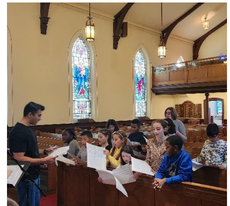
Advent Children's Choir Rehearsing for Lesson & Carols