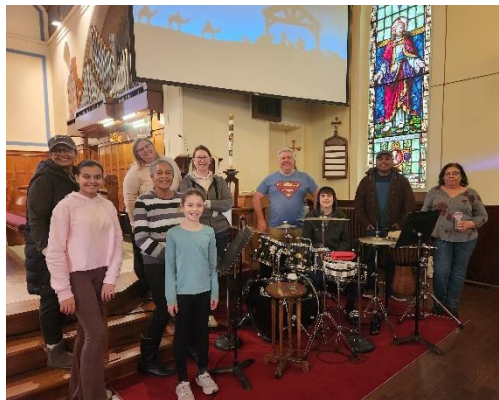
Advenio Rehearsal Dedicated Saturday Afternoons