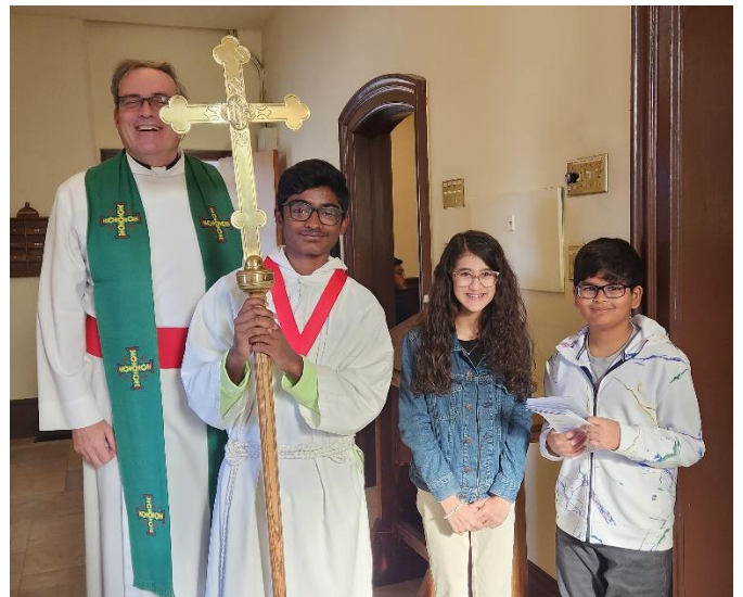
A warm Sunday welcome!