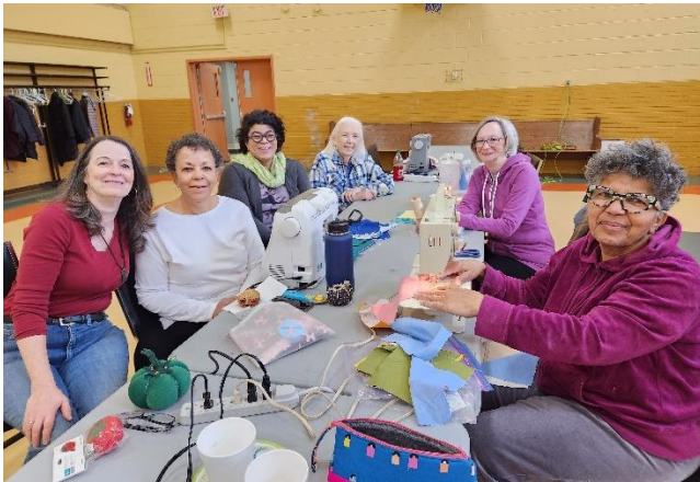
Sacred Sewers meets monthly on the 4 th Saturday

Subscribe to our YouTube Channel and read our weekly announcements.