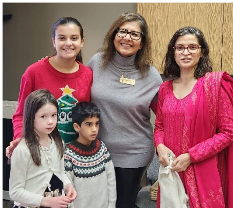
Pageant Preparation It takes a village