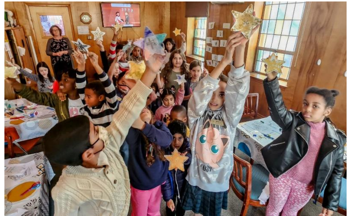
A full Sunday School making Christmas Pageant props