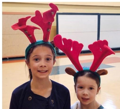
Caring & Sharing “Soft Launch” (2022)