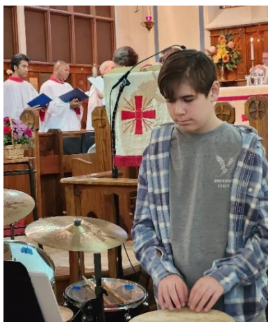
The Reign of Christ (2022)