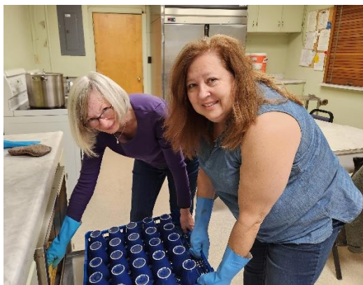
Prepping for 1 st Coffee Hour since March 2020