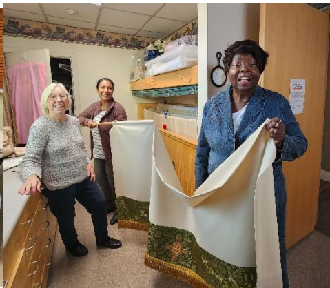
The Altar Guild welcomes a new member