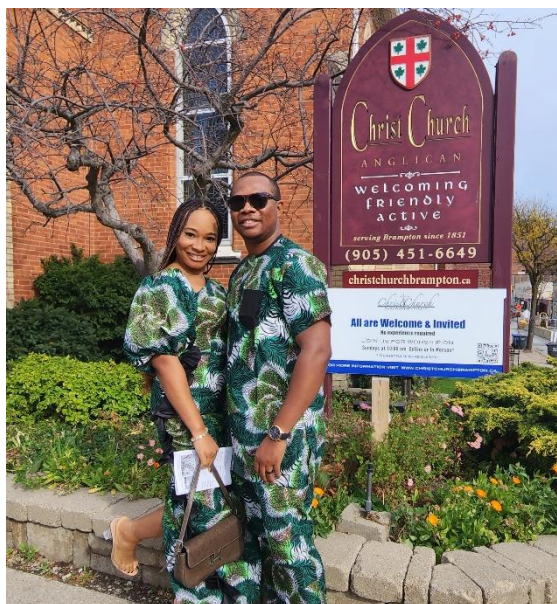
A fond farewell.... ...and a warm welcome.