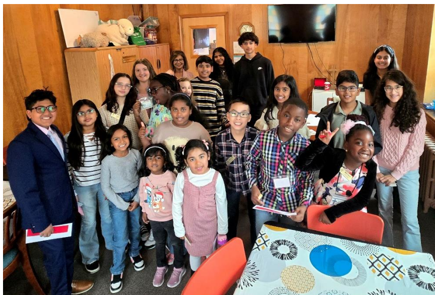
Thanksgiving Sunday | October 13, 2024