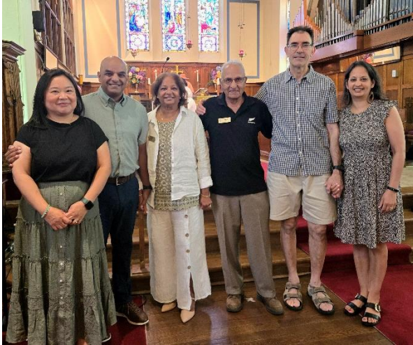
Below: Summer dresses (left) and warm hospitality (right).